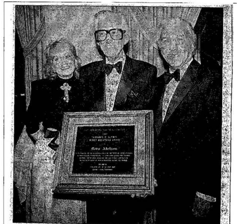
Chairman honored —Merv Adelson, chairman of Lorimar-Telepictures Corp., was honoree at American Jewish Committee's 1987 Sherrill C. Corwin Human Relations award dinner Sunday at Beverly Wilshire. ABC News correspondent David Brinkley was guest speaker at black-tie event. With Adelson, right, is wife and "20/20" host Barbara Walters and Lew Wasserman, chairman and CEO of MCA Inc., and honorary co-chairman of dinner. L.A. Times Oct. 27, 1987

Geraldo. The joys and desirability of whites having sex with blacks and Orientals is celebrated by host Geraldo Rivera in this 1991 program.