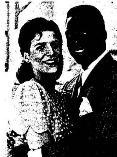
Perrey Reeves and Sterling Macer Jr. play an interracial couple in ABC's Hometront .

The "skeletons" referred to in the mendacious movie featured in the promotional advertisement above, are all in the whites' closets. This is another entry in the Hollywood genre of innocent blacks framed, oppressed and brutalized by unspeakably evil whites. Such movies exacerbate black paranoia, resentment and anti-white hatred, all in the name of human rights.