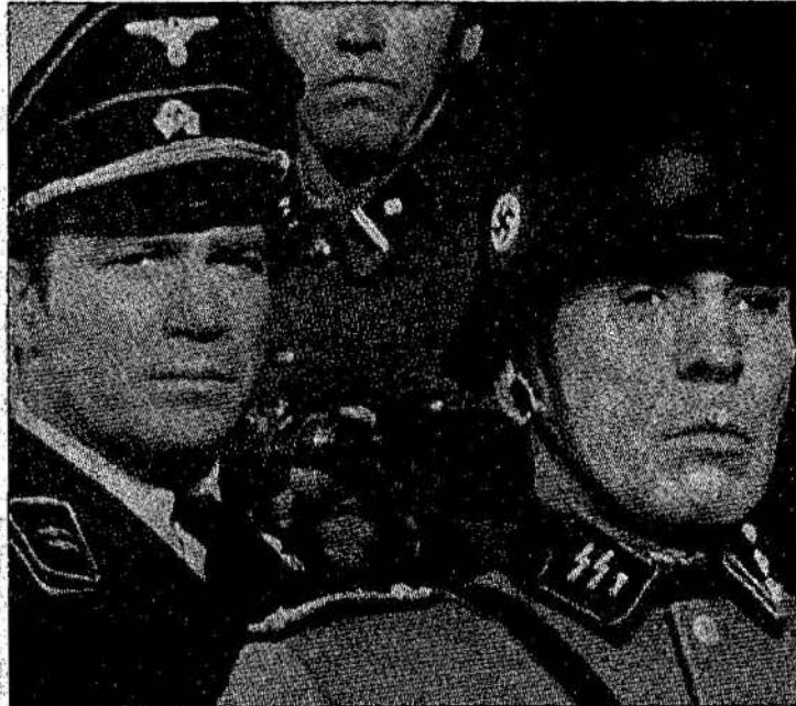
William Shatner and Leonard Nimoy in an episode of Star Trek

white violence and oppression," making it "easy to understand the rage roiling through South Africa's black townships." (NY Times, April 20, '94).